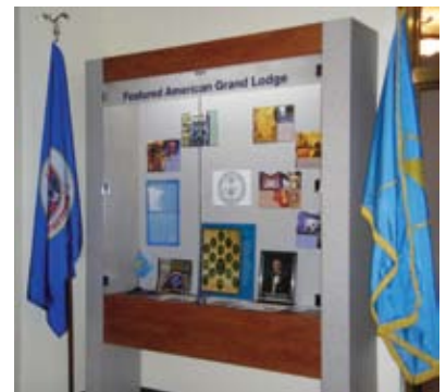
Minnesota was the featured Grand Lodge of the Month in July.

January - North Dakota, February - The George Washington Masonic Memorial, March - South Dakota, April - Montana, May - California, June - West Virginia, July - Idaho, August - Wyoming, September - Oklahoma, October - New Mexico, November - Arizona and December - Alaska.