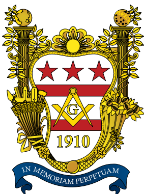
New logo combines Washington Family Crest with Masonic symbols

On February 22, 1910, Freemasons from all across the country met in Alexandria, Virginia to create a permanent chartered association for the purpose of building a suitable memorial temple to honor the memory and legacy of America's foremost Freemason, George Washington. The 100th Anniversary of that historic first meeting and founding of the George Washington Masonic National Memorial Association is fast approaching and the Association will celebrate with a day of festive events on February 22, 2010.