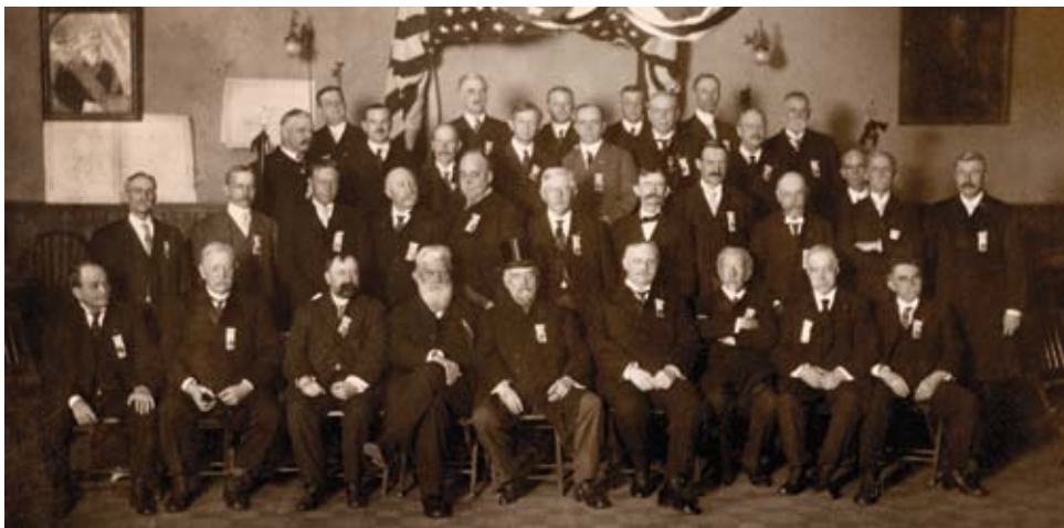
The first meeting of the George Washington Masonic National Memorial Association was held at Alexandria-Washington Lodge No. 22 above Alexandria City Hall on February 22, 1910.