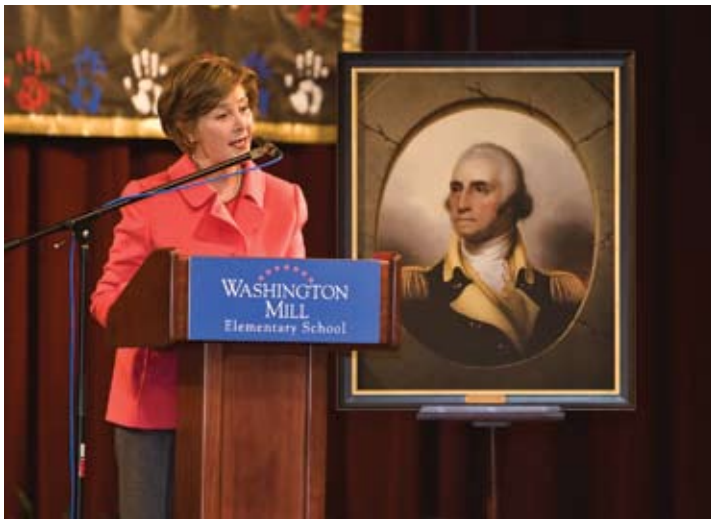
First Lady Laura Bush speaks at Washington Mill Elementary School in Alexandria in support of the "George Washington's Return to School" program to distribute the Rembrandt Peale portrait of Washington to every school in America. The school is located on land that was once owned by Washington.

First Lady Laura Bush addressed students, faculty and distinguished guests at Washington Mill Elementary School in Alexandria, Virginia on January 15 to officially launch Mount Vernon's program to distribute portraits of George Washington to every school in America. The program was initiated last year to commemorate Washington's 275 th birthday. The George Washington Masonic Memorial has joined with Mount Vernon to support this worthy endeavor and announced its participation at the Annual Meeting last February in Portland, Oregon.