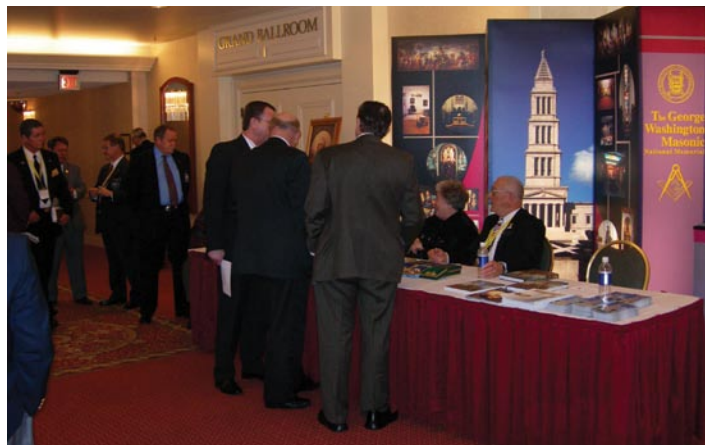
Delegates visit the Memorial's booth at the Conference.

With our new vision statement developed, some exciting projects underway, and our 100 th Anniversary only three years away, we look forward to working with this new Executive Committee and Board of Directors for the betterment of the Association and the Memorial.