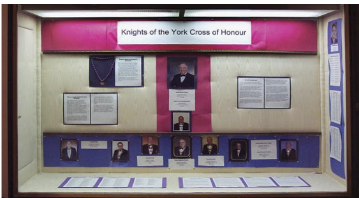
The Knights of the York Cross provided an impressive exhibit to celebrate their month in November.

November was Knights of the York Cross of Honour Month at the Memorial. The Knight of the York Cross of Honour is comprised of York Rite Masons who have presided over a Blue Lodge, Chapter, Council and Commandery. After so serving, a candidate must be proposed by one already a member and balloted on by the membership of the state body, called a Priory. There is but one Priory per state, headed by a presiding officer called a Prior.