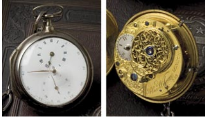
The jeweled pocket watch of Dr. Elisha Cullen Dick was used to time Washington's pulse on the day he died, December 14, 1799.

The George Washington Museum, located on the 4 th floor of the Memorial, is pleased to announce that it has recently acquired the gold pocket watch that was used to time the pulse of Washington during his final illness. The watch belonged to Dr. Elisha Cullen Dick, one of three physicians attending Washington.