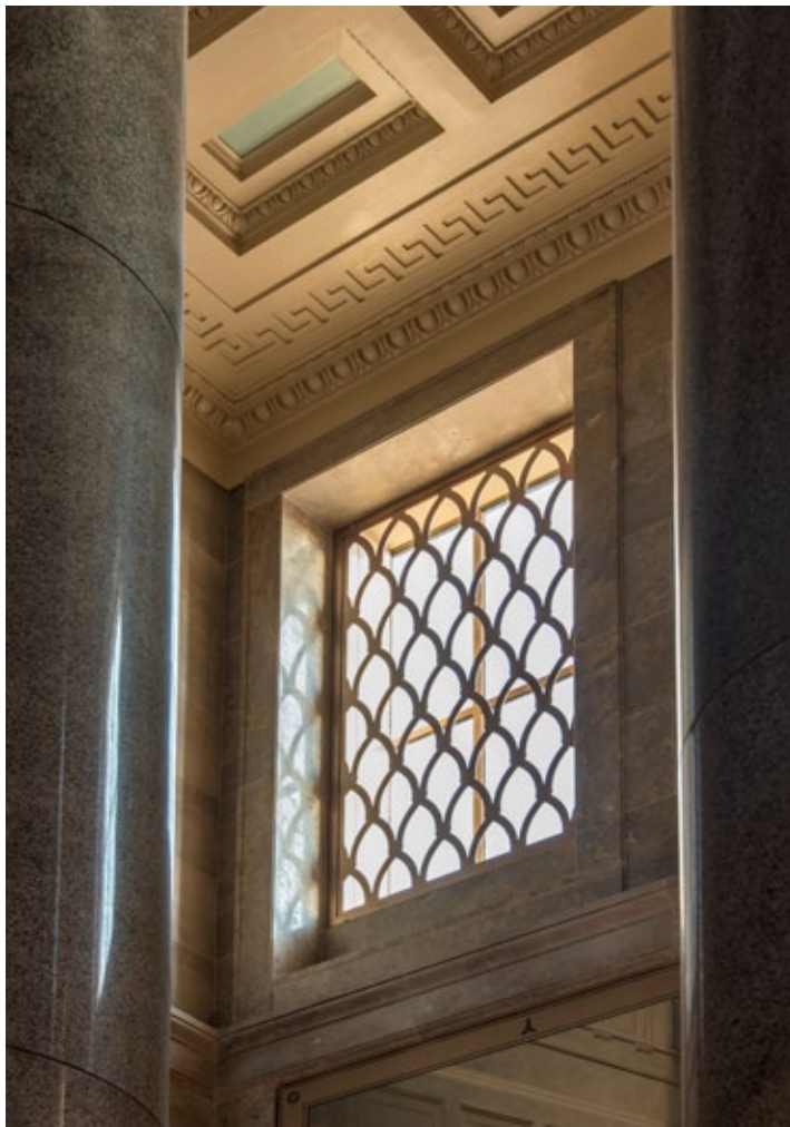
Sunlight streams into Memorial Hall through the updated windows, installed in 2020.