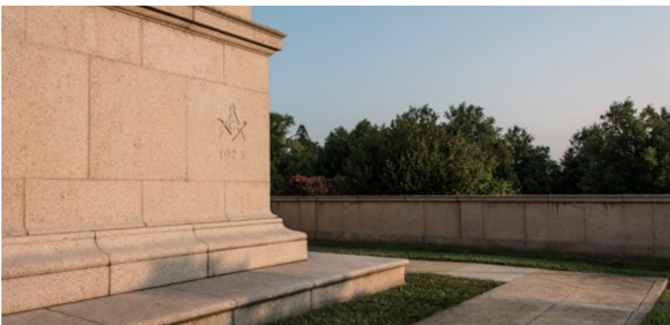
The Memorial's cornerstone at dawn. Its dedication ceremony in 1923 was a national Masonic event. Join us in 2023 to re-dedicate the cornerstone and be a part of the Memorial's next century of service.

Visitors come here from all over the world to be inspired by Washington's life, as well as to learn about Masonry and how it is part of our national fabric. This message is more vital and relevant than ever before. Please join us on February 20, 2023, for a day of celebration, including a parade from historic Alexandria to the steps of the Memorial. The ceremony will be followed by photographs, a reception, entertainment, and a Gala Birthday Banquet. Plan now to attend, and be part of our second century of making history.