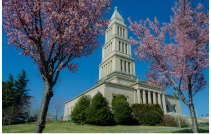
Dedicatory trees complement the Memorial's striking appearance with natural beauty.

Information, including a printable order form, is available on our website at https://gwmemorial.org/products/tree . For additional information about how you can participate in this program with a tree or a bench, please contact George D. Seghers at gseghers@gwmemorial.org or 703-683-2007, ext. 2010.