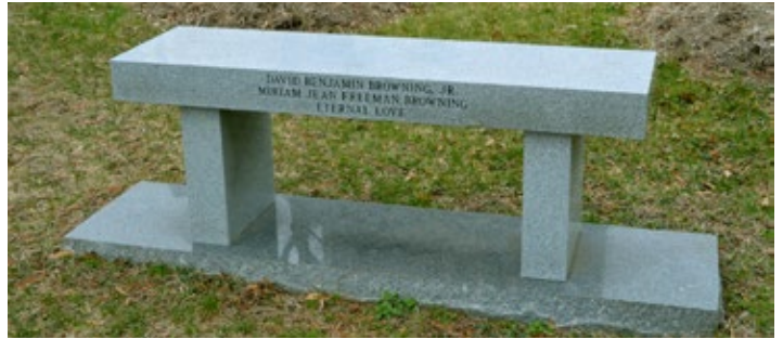
A bench dedication provides an elegant and enduring statement.