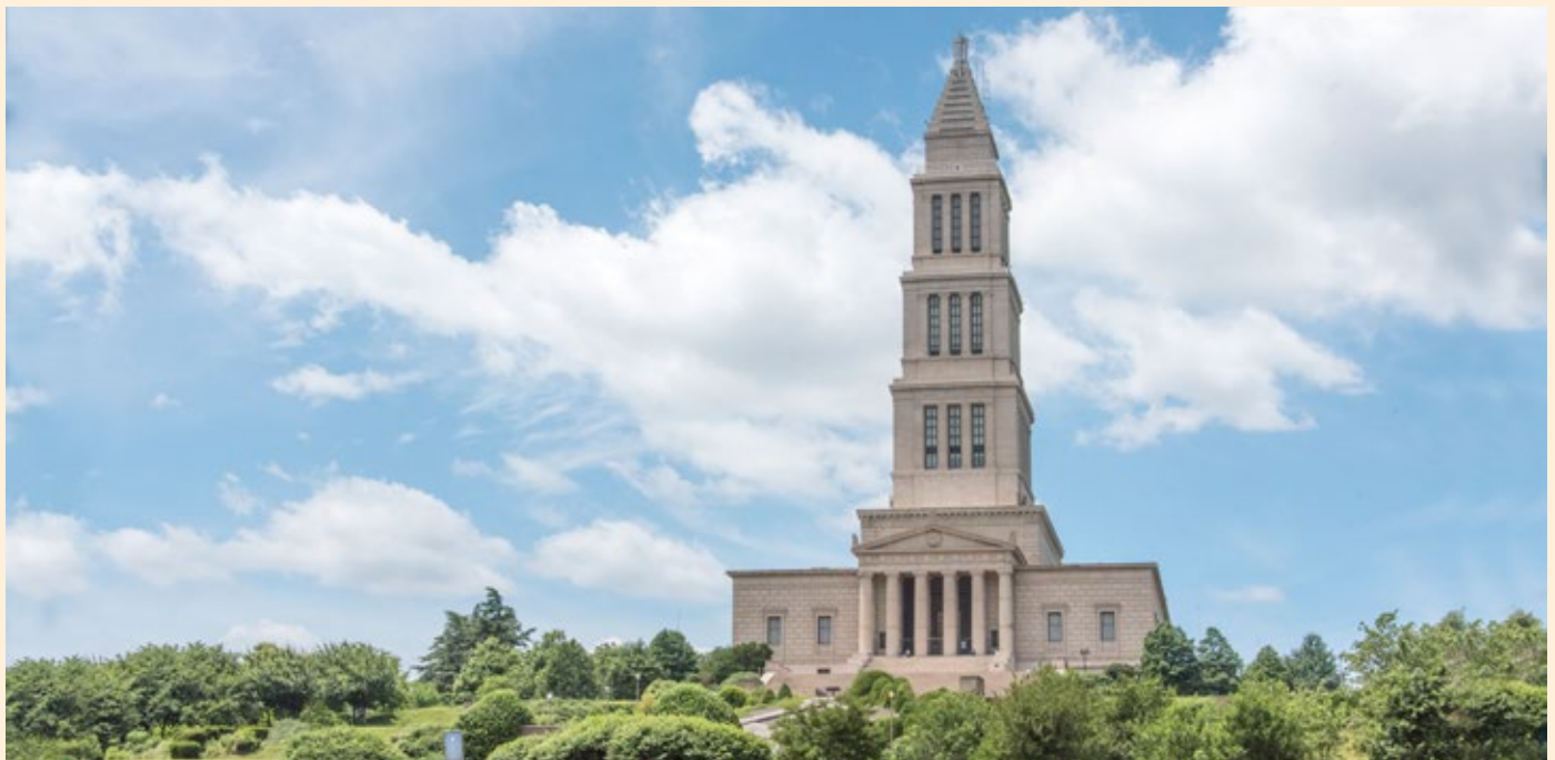
On a beautiful early summer day, the Memorial stands as a beautiful sentinel in honor of George Washington.