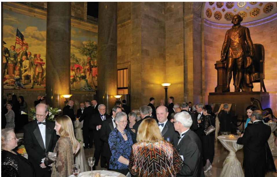
The reception in Memorial Hall provided attendees with a cordial beginning to the evening's festivities.

The Memorial is proud to exemplify and encourage Freemasonry's prominent role in this important national observance. Preparations are moving forward for next year's observance.