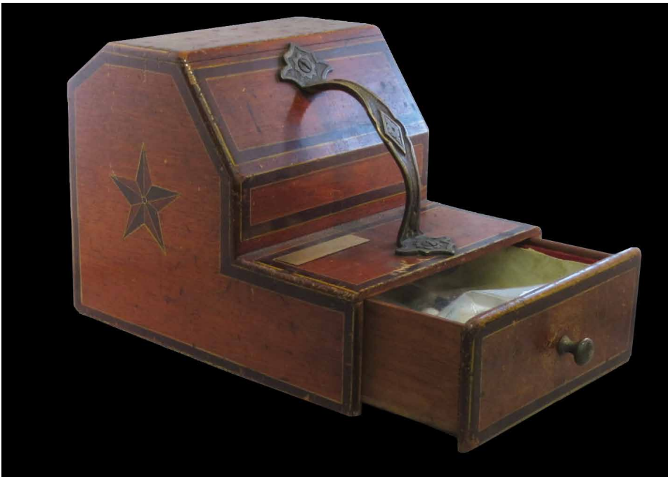
A Masonic ballot box displayed at the Memorial during January, on loan from the Grand Lodge of Alabama.