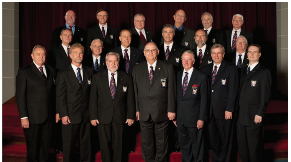
Members of the Board of Directors at the Memorial during the Semi-Annual Board Meeting in August.

The Semi-Annual Board Meeting of 2010 was held on August 13 and 14. The focus was the adoption of a Long Range Strategic Plan.