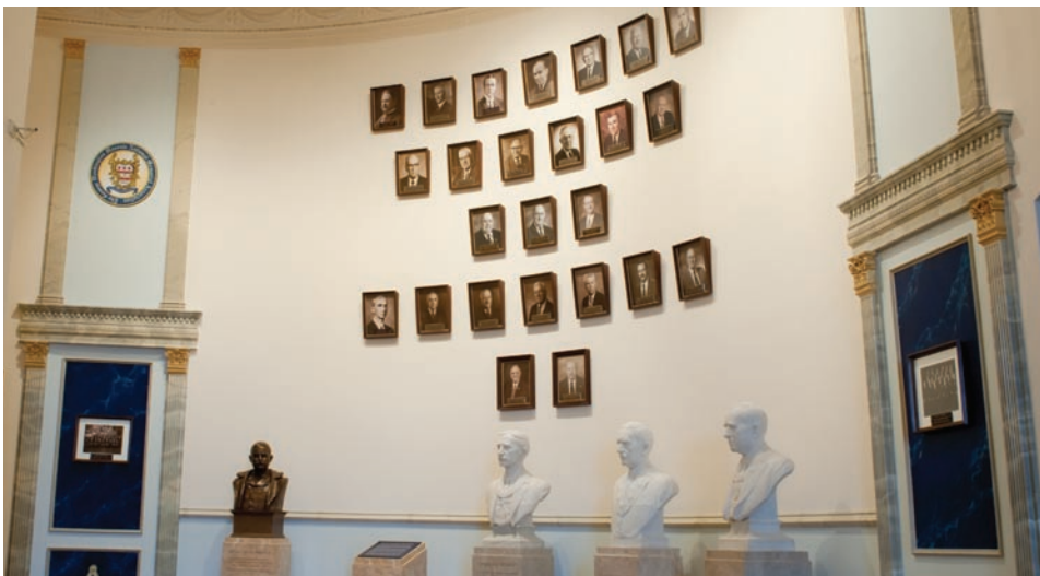
Founders Hall honors the remarkable Masons that created the Association and built the Memorial.